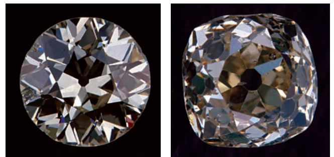
Figure 3. These are face-up views of "Old European Cut" (left) and "Old Mine Cut" (right) diamonds like those that were prevalent when Tolkowsky wrote Diamond Design . The European cut diamond looks somewhat modern, but has a larger culet and a very small table (45%) by modern standards. (Since old-cut diamonds came in a variety of shapes, the diamonds above should only be considered examples of their cut types.)

As discussed in "Diamond Optics Part 2," Tolkowsky considered the dispersion of light rays into spectral colors, but only as they exited the diamond.