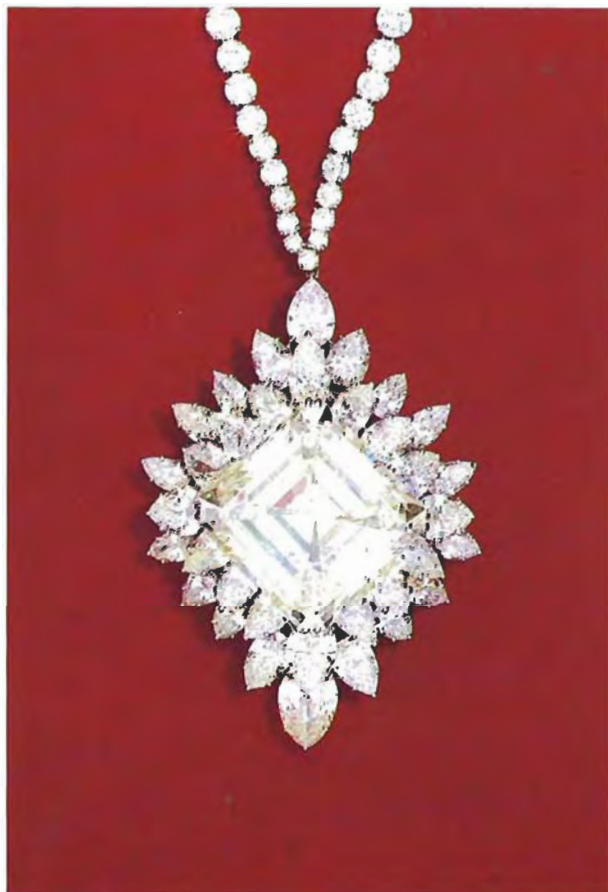
Figure 2. The original Bruce Winston diamond, a 59.25-ct emerald cut.

de Poitiers. It can be seen in one of the many portraits of her that were painted while she resided at Fontainebleau.