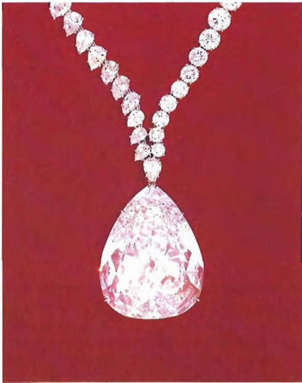
Figure 6. The Star of Independence , a 75.52-ct D-flawless diamond fashioned in the spring of 1976 from a 204.10-ct piece of rough.

he sold it to King Farouk of Egypt for $1,000,000. At the time of Farouk's overthrow (1952), the stone still had not been paid for. It took Mr. Winston several years of litigation to obtain access to a safe deposit box in Switzerland to reclaim the Star of the East.