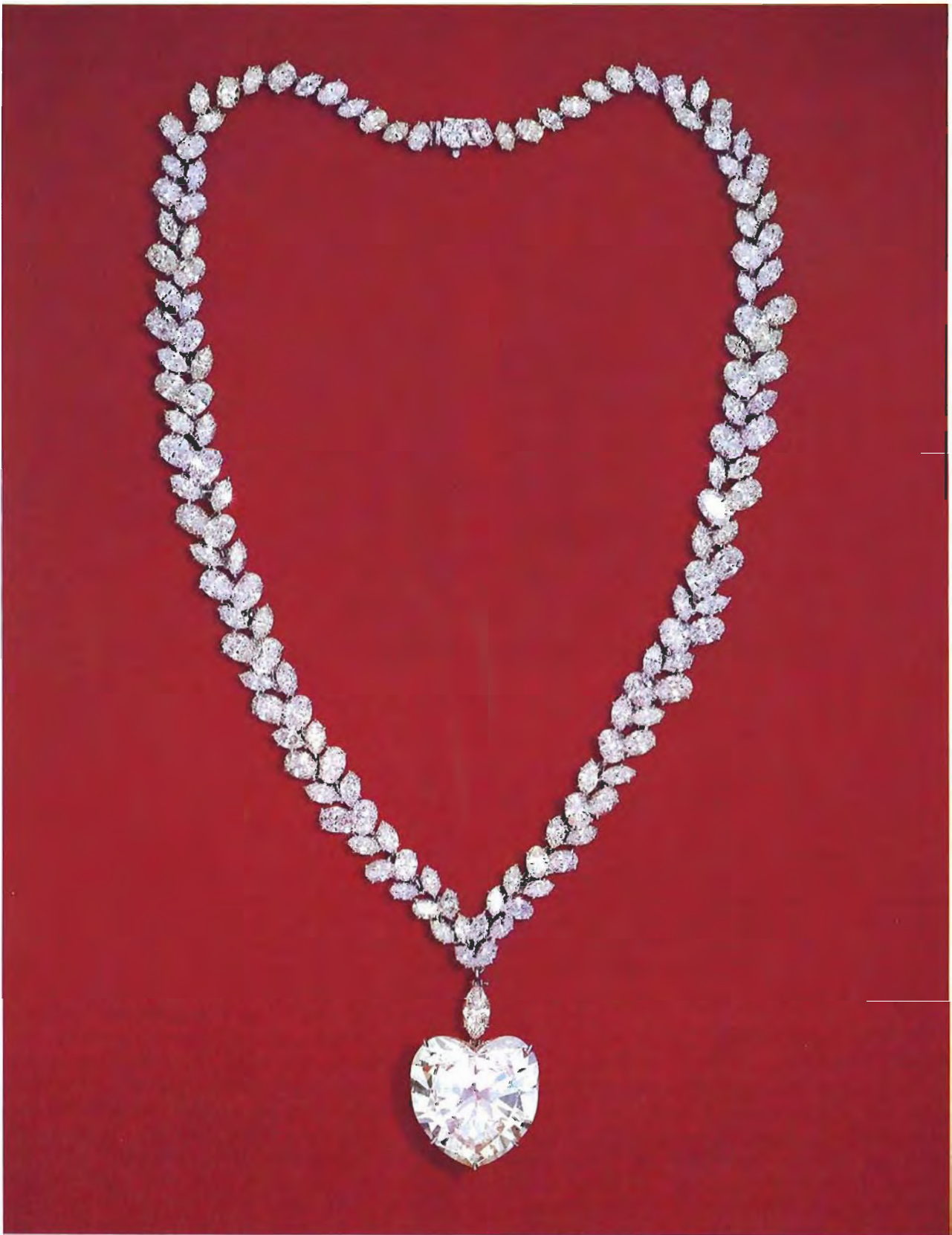
Figure 3. The Bruce Winston diamond recut to a 40.97-ct heart shape.