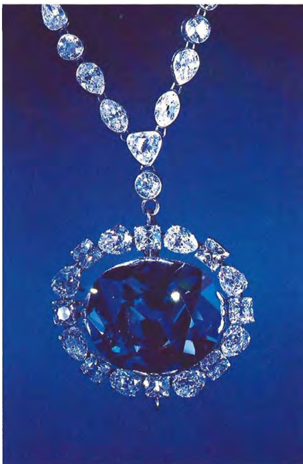
Figure 4. The legendary 45.52-ct Hope diamond was donated to the Smithsonian Institution by Harry Winston.

In 1911, Pierre Cartier acquired the Hope in Paris and sold it for $154,000 to Edward B. McLean, then owner of the Washington Post, as a gift for his wife. Despite the diamond's previous history, Mrs. McLean laughed at the legend that had grown around it. She often wore the Hope at parties with her 94.80-ct pear-shaped diamond, the Star of the East. When she was not wearing these