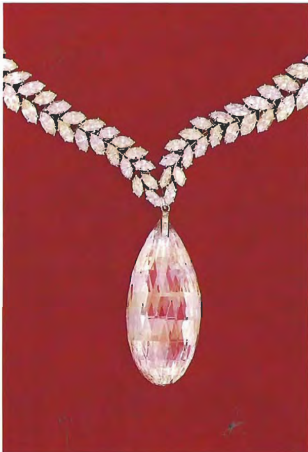
Figure 1. The Briolette of India, a 90.38-ct stone that may be the oldest faceted diamond on record.