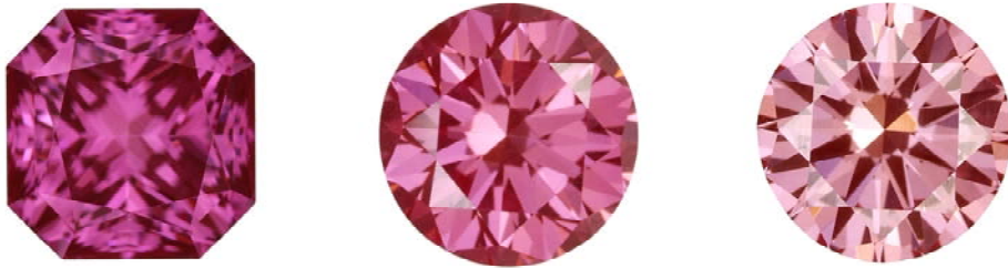
Figure 1. These 0.28–0.67 ct CVD-grown diamonds displayed intense pink colorations, and were color-graded as Fancy Intense to Fancy Vivid pink or purplish pink. The samples were produced using “standard production techniques” at Apollo for this type of stone.

Many gemological and spectroscopic properties of these CVD diamonds were similar to treated natural and synthetic HPHT diamonds with respect to color and spectroscopy. Obviously, these pink CVD-grown diamonds are very impressive gemstones. During gem testing, identifying CVD synthetic diamonds is a challenge. Intense color and strong fluorescence produced by the N-V centers often hides many features that are commonly used to identify CVD diamonds. Despite this difficulty, these CVD-created diamonds can be reliably identified using a series of gemological and spectroscopic features, including growth patterns observed from DiamondView fluorescence images and the occurrence of a 3123\text{ cm}^{-1} infrared absorption feature and the Si-related doublet through absorption/photoluminescence spectroscopy.